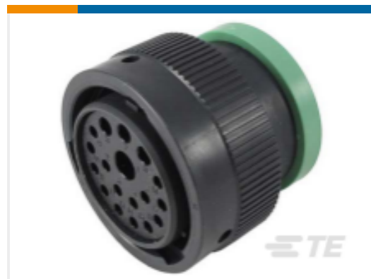
TE Part #HDP26-24-18SN-L017 PLG, 18P, BLK, N, RNG, 8/12/16, S