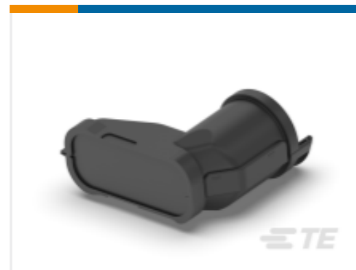
TE Part #SRK-BS-MD-ST-001 BKSHL, MED, BLK, ST, NW 17/22