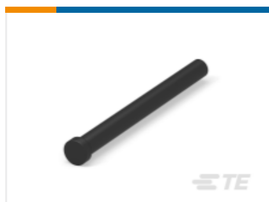
TE Part #2236369-1 61103 DVI LOCKING SEALING PLUG #16