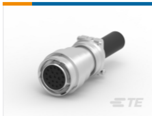
TE Part #HD36-18-20SN-059 PLG,20P,AL,N,CBLCLMP BT,DRAIN,16 /20,S,MC