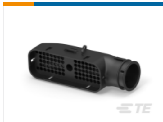
TE Part #0528-012-7005 BKSHL, 70P, BLK, PLG, RA, NO RIB, NW 26