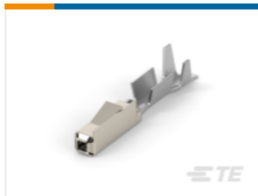
TE Part #5-963729-1 MQS SOCKET CONTACT