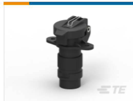
TE Part #CAR2SC68 CAR RECPT DIN9680 2way, IP68