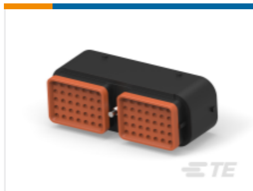
TE Part #DRC16-70SCE-P013UK PLG, 70P, BLK, E, SEAL BOND, C