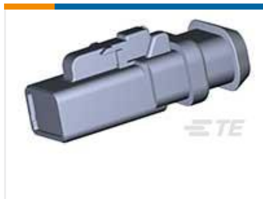
TE Part #DTP06-2S-EE01 PLG, 2P, BLK, N, XCAP