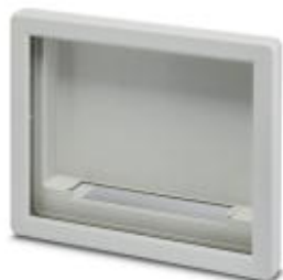
Display housing, 15", light gray, central window, front level, with cutout for connection technology angle plate consisting of two half shells with screws

Please be informed that the data shown in this PDF Document is generated from our Online Catalog. Please find the complete data in the user's documentation. Our General Terms of Use for Downloads are valid ( http://phoenixcontact.com/download )