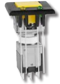
EB Series Pushbutton with AT212 Bezel & AT617 LEDs

Revisions for the AT212 Bezel are on page 2, with the affected standard part numbers.