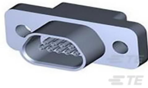
TE Part #1532177-1 M83513/04-G01N, MCKS-N1-B- 51S6G1-18.0