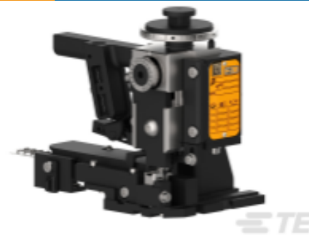
TE Part #2836167-1 OCEAN_2_0_Applicator-S-045F