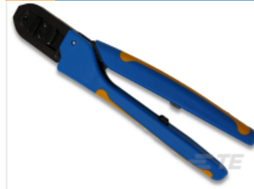
TE Part #2844982-1 CCII TYPE VI MLTIMATE PIN/SKT 22- 18 ASSY