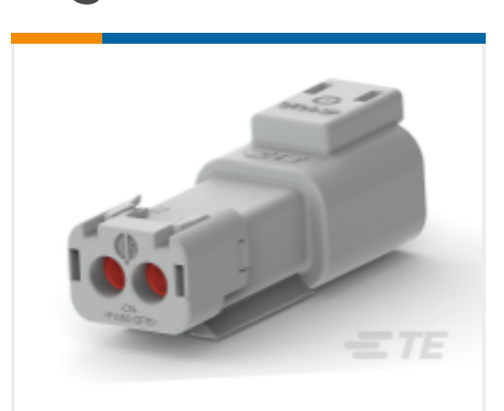
TE Part #DT04-12PA-P075 DEUTSCH DT Receptacle Connectors