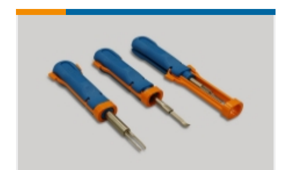
Insertion & Extraction Tools(3)