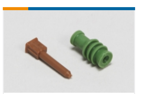
Automotive Seals & Cavity Plugs(5)