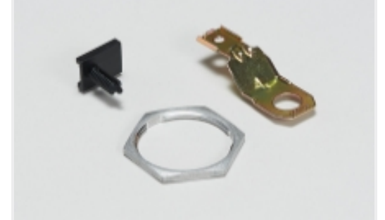
Other Automotive Connector Accessories(16)