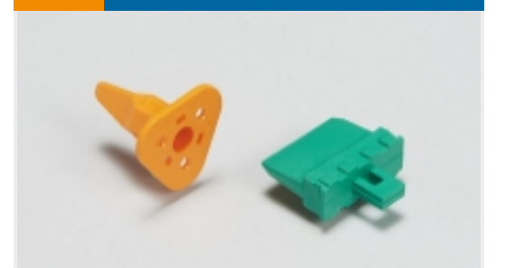
Automotive Connector Locks & Position Assurance(74)