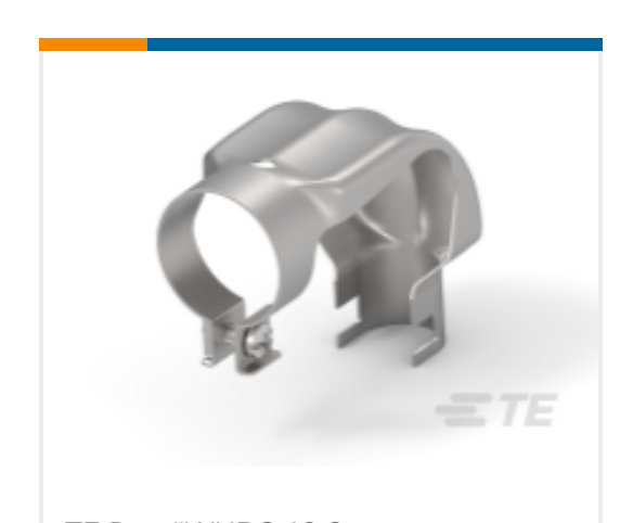
TE Part #WHDS-18-2 STRAIN RELIEF, HD30, 18SZ, RA