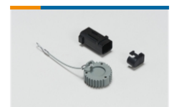
Automotive Connector Caps & Covers (107)