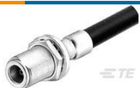
TE Part #225094-1 N SER BHD JACK WEATHERPROOF