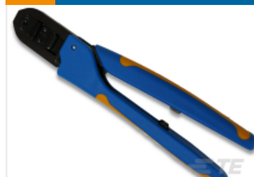
TE Part #2844982-1 CCII TYPE VI MLTIMATE PIN/SKT 22- 18 ASSY