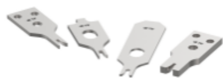
CRIMPER REPRESENTATION ONLY