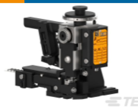
TE Part #2836167-1 OCEAN_2_0_Applicator-S-045F