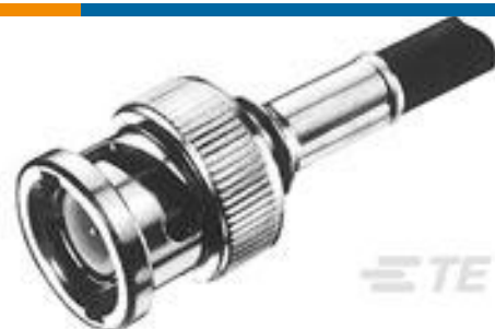
TE Part #227079-9 COMM. BNC-PLUG