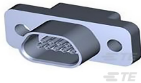
TE Part #1532177-1 M83513/04-G01N, MCKS-N1-B- 5156G1-18.0