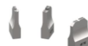
ANVIL REPRESENTATION ONLY