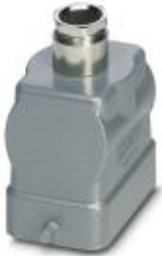
HEAVYCON B6 sleeve housing, for single locking latch, height: 56 mm, with screw connection, 1 x Pg13.5 gland, straight cable outlet

Please be informed that the data shown in this PDF Document is generated from our Online Catalog. Please find the complete data in the user's documentation. Our General Terms of Use for Downloads are valid ( http://phoenixcontact.com/download )