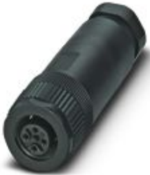
Bus system connector, 5-position, Socket straight M12, B-coded, Screw connection, knurl material: Plastic, cable gland Pg9, external cable diameter 6 mm ... 8 mm

Please be informed that the data shown in this PDF Document is generated from our Online Catalog. Please find the complete data in the user's documentation. Our General Terms of Use for Downloads are valid ( http://phoenixcontact.com/download )