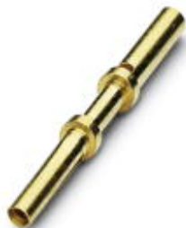
Crimp contact, turned, contact diameter: 0.6 mm, crimp range: 0.14 mm 2 ... 0.34 mm 2

Please be informed that the data shown in this PDF Document is generated from our Online Catalog. Please find the complete data in the user's documentation. Our General Terms of Use for Downloads are valid ( http://phoenixcontact.com/download )