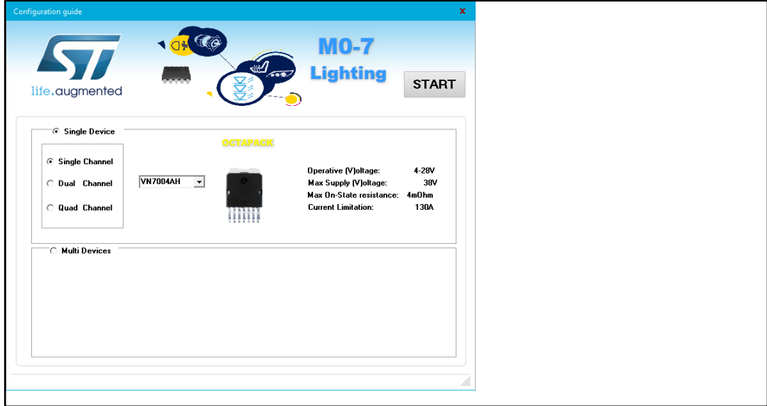
Figure 2: Gui interface

GUI is available to control the entire system, that is to say SPC560B-DIS Discovery board connected with the VIP-M07-ADIS application board. For more information, and download of the latest version available, please refer to ST web www.st.com .