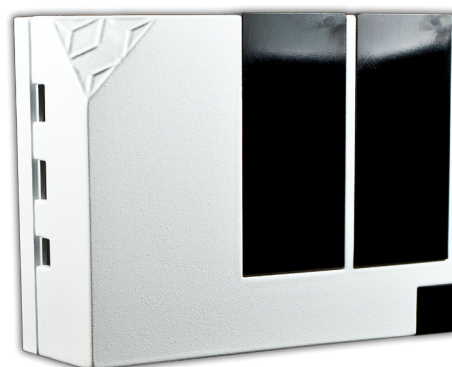
Argos 3D - P100

Using active IR illumination, the sensor is able to capture 3D and 2D information at a resolution of 160 x 120 pixels with up to 160* frames per second independently of ambient light. With a range of up to 3m, a field of view of 90° and a size of only 75 x 57 x 26 mm, this USB connected sensor can be used for next generation systems in various application fields like robotics, gesture recognition, HMI or people counting.