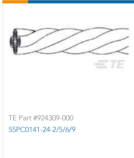
TE Part #924309-000 55PC0141-24-2/5/6/9