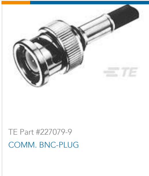
TE Part #227079-9 COMM. BNC-PLUG