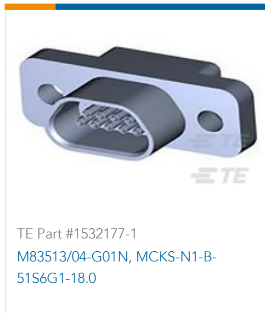
TE Part #1532177-1 M83513/04-G01N, MCKS-N1-B- 51S6G1-18.0