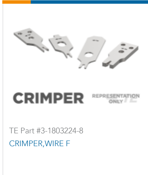
TE Part #3-1803224-8 CRIMPER, WIRE F