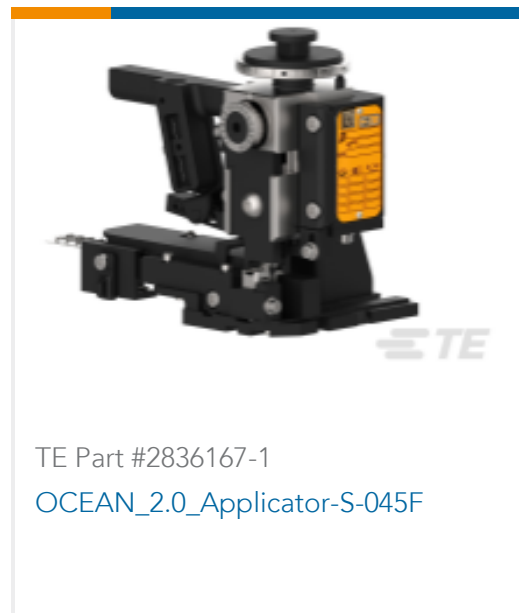
TE Part #2836167-1 OCEAN_2.0_Applicator-S-045F