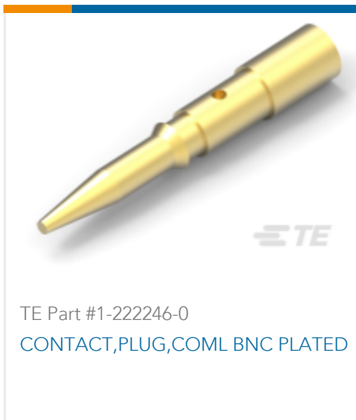
TE Part #1-222246-0 CONTACT, PLUG, COML BNC PLATED