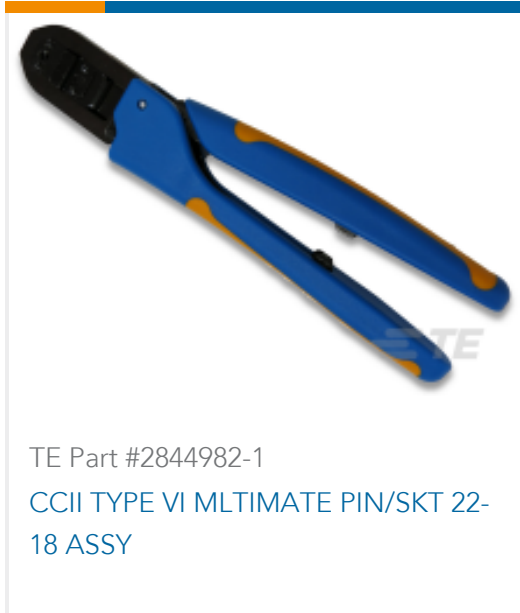
TE Part #2844982-1 CCII TYPE VI MLTIMATE PIN/SKT 22- 18 ASSY