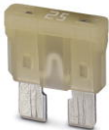
Fuse, nominal current: 25 A, length: 19 mm, width: 5 mm, height: 19.7 mm

Please be informed that the data shown in this PDF Document is generated from our Online Catalog. Please find the complete data in the user's documentation. Our General Terms of Use for Downloads are valid ( http://phoenixcontact.com/download )