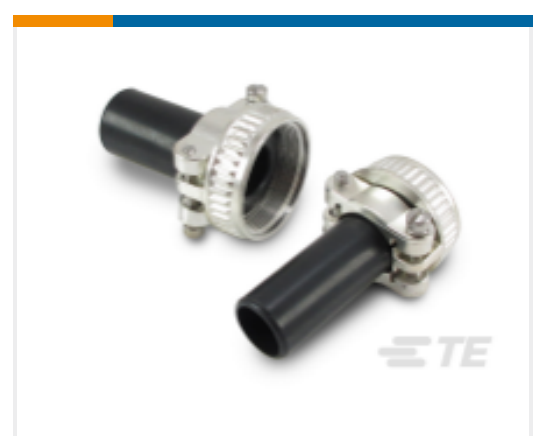
TE Part # CAT-H3930-B128 DEUTSCH HD30 Backshells