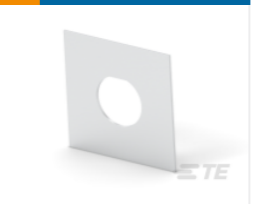
TE Part # 24-D-PUNCH D-HOLE PUNCH, SIZE 24