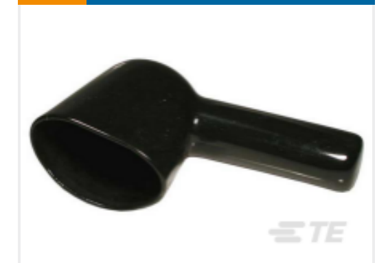
TE Part # HD30-24BT-90-BK BOOT, 24SZ, RA, BLK

TE Part # CAT-D48-SFT273 DEUTSCH Stamped and Formed Contacts