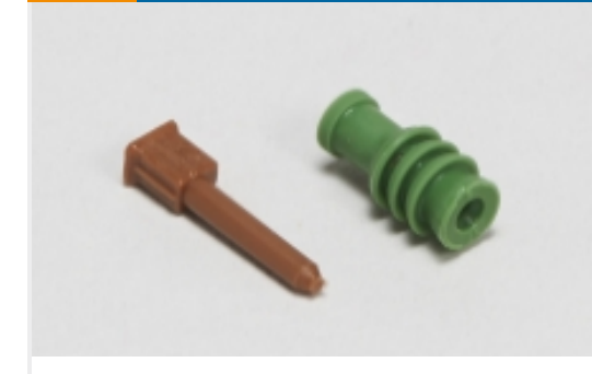
Automotive Seals & Cavity Plugs(10)