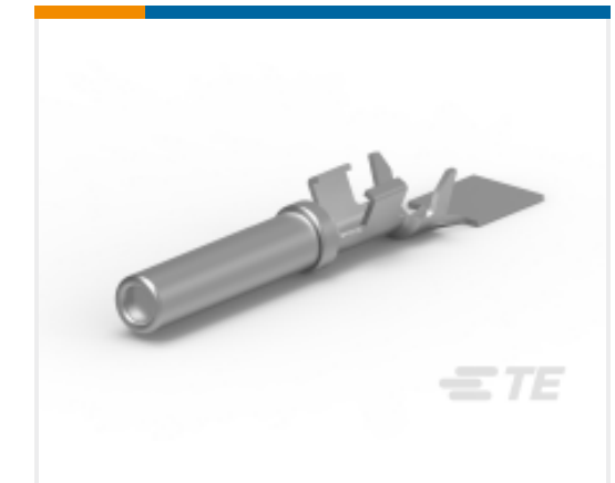
TE Part # CAT-J67-DSCC16 DEUTSCH Size 16 Crimp Contacts