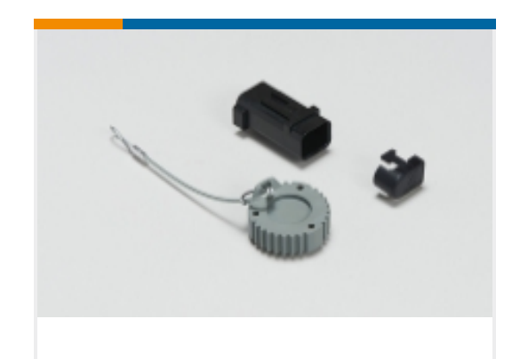
Automotive Connector Caps & Covers