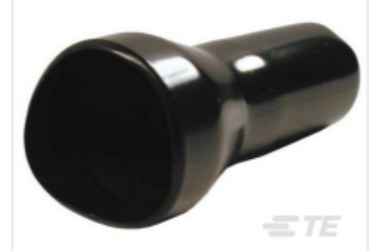
TE Part # HD30-24BT-BK BOOT, 24SZ, ST, BLK