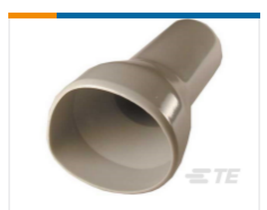
TE Part # HD30-24BT BOOT, 24SZ, ST, GRY