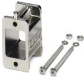
Spacer for panel mounting frames

Please be informed that the data shown in this PDF Document is generated from our Online Catalog. Please find the complete data in the user's documentation. Our General Terms of Use for Downloads are valid ( http://phoenixcontact.com/download )