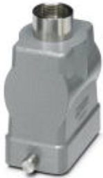
HEAVYCON B10 sleeve housing, for single locking latch, height: 72 mm, with 1 x Pg21 gland, straight cable outlet

Please be informed that the data shown in this PDF Document is generated from our Online Catalog. Please find the complete data in the user's documentation. Our General Terms of Use for Downloads are valid ( http://phoenixcontact.com/download )