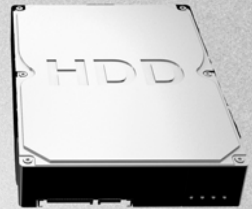
Exact Specifications of Standard 3.5" Hard Drive