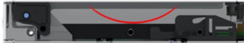
Smart-Fit Anti-Vibration (With 15mm Drive)