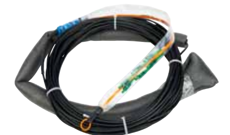
3M™ External Cable Assembly Module (ECAM) Factory Terminated Fiber Cable Assembly (FCA)