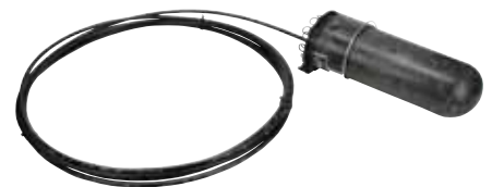
3M™ Fiber Dome Stubbed Terminal FDST 08S