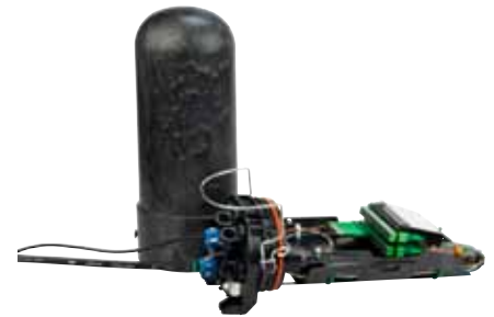
3M™ Fiber Dome Stubbed Terminal FDST 08S

The FDST 08S terminal features a fixed O-ring sealing system along with an innovative latching mechanism. This combination provides simple, virtually error-free terminal sealing and re-entry. Also, the re-entry feature allows easy access to clean and repair connectors and replace the terminal or terminal tail in the event that either of these are damaged.