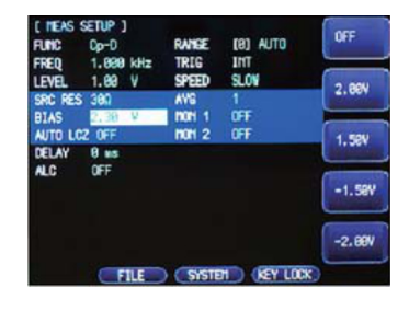
Internal Bias (±2.5V Adjustable) Ideal for Capacitive Components' Characteristic Tests