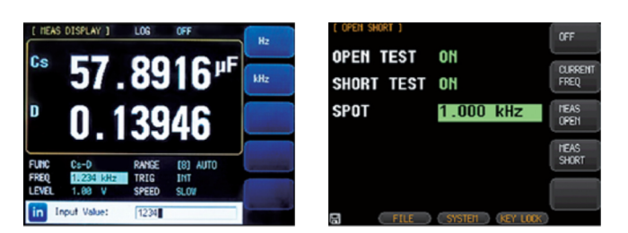
Consecutive and Adjustable Frequency Selectable Fixture Zeroing Methods Freely Input Frequency Within Provided Full Frequency Range Zero or Spot Zero Frequency Range

consecutive and adjustable frequency capability which allows users to conduct measurement and analysis on components with the most genuine frequency requirements. For OPEN/ SHORT fixture compensation function, the T3LCR series is equipped with full frequency range zero and spot zero selections. After executing full frequency range users can freely change test frequency to execute component measurements without having to power off the instrument or changing the test fixture. This allows for a faster measurement time during repeated zeroing operations.