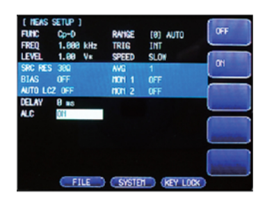
Automatic Level Control Ideal for Measuring Components With Voltage Requirements