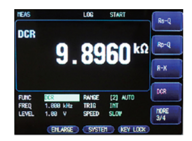
D.C. Resistance Measurement Ideal for inductive components' D.C. Characteristics Verification

To satisfy the diverse measurement application requirements for different components and materials, the T3LCR series offers many auxiliary measurement functions.