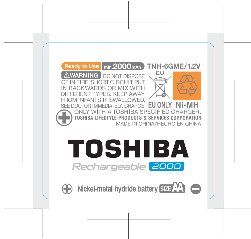
(Fig-2) Product label