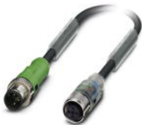
Sensor/actuator cable, 3-position, Variable cable type, Plug straight M12 SPEEDCON, A-coded, on Socket straight M12 SPEEDCON, A-coded, with 2 LEDs, cable length: Free input (0.2 ... 40.0 m)

Please be informed that the data shown in this PDF Document is generated from our Online Catalog. Please find the complete data in the user's documentation. Our General Terms of Use for Downloads are valid ( http://phoenixcontact.com/download )