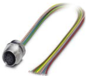
Sensor/actuator flush-type socket, 8-pos., M12, A-coded, front/screw mounting with M16 thread, with 1 m TPE litz wire, 8 x 0.25 mm 2

Please be informed that the data shown in this PDF Document is generated from our Online Catalog. Please find the complete data in the user's documentation. Our General Terms of Use for Downloads are valid ( http://phoenixcontact.com/download )