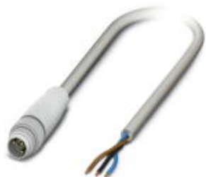
Sensor/actuator cable, 3-position, PP-EPDM halogen-free, gray RAL 7035, Plug straight M8, on free cable end, cable length: 10 m, Hygienic design, with plastic knurl

Please be informed that the data shown in this PDF Document is generated from our Online Catalog. Please find the complete data in the user's documentation. Our General Terms of Use for Downloads are valid ( http://phoenixcontact.com/download )