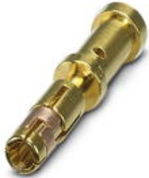
Crimp contact, turned, contact diameter: 1 mm, crimp range: 0.34 mm 2 ... 0.5 mm 2

Please be informed that the data shown in this PDF Document is generated from our Online Catalog. Please find the complete data in the user's documentation. Our General Terms of Use for Downloads are valid ( http://phoenixcontact.com/download )