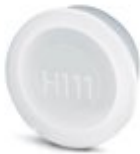
Plastic protection cap for connectors with M23 knurled nut

Plastic anti-static dust protection cap - RC-Z2468 - 1611796