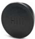
Plastic protection cap, antistatic, for connectors with M23 knurled nut

Plastic anti-static dust protection cap - RC-Z2468 - 1611796