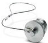
Metal protection cap with steel wire and loop, for M23 signal connectors with knurled nut for fastening to the cable

Metal protective cap - CA-Z0077 - 1627224