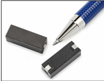
FP2207R1-R230-R Rev B Proposal