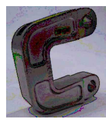
-5 AS SHOWN