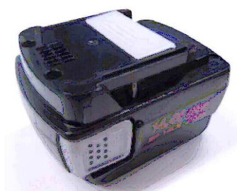
-3 AS SHOWN