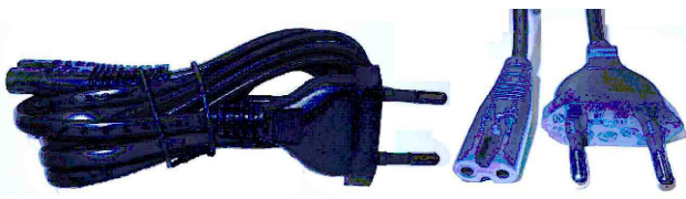
-4 AS SHOWN