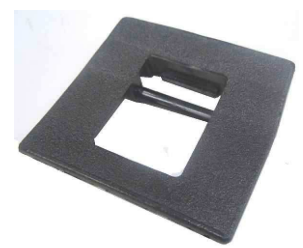
-6 AS SHOWN