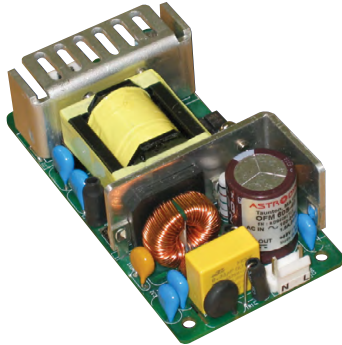
2"W x 4"L x 1.244"H