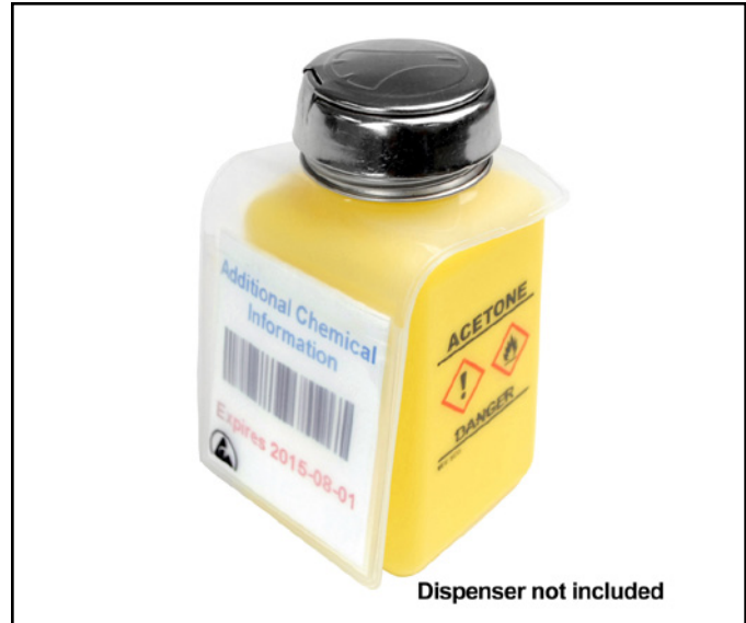
Figure 2. Item 35393 installed on a 6 oz bottle