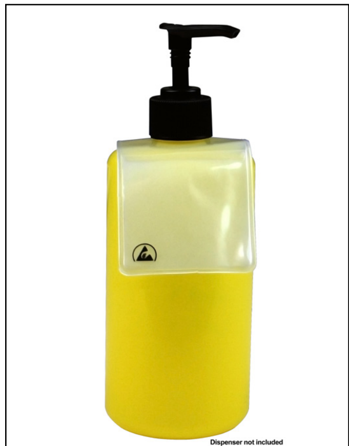
Figure 2. Item 35394 installed on an 8 oz wash bottle