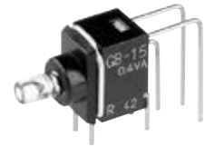
LED Changes for GB Illuminated Pushbuttons

The GB Illuminated Pushbuttons will have a change to the LED specifications for Red, Amber and Green. The change will effect all illuminated models, both standard and custom. The specification changes are outlined below, followed by effected standard part numbers.