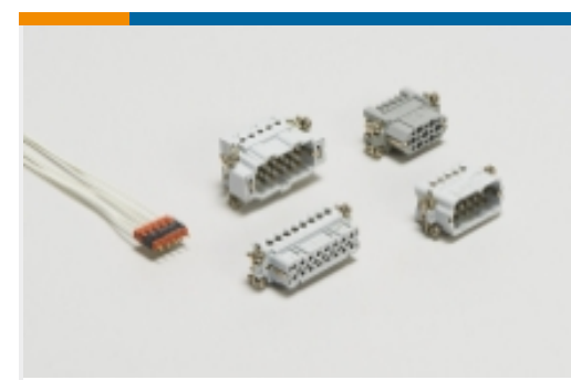
Rectangular Contact Inserts(119)