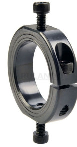
*Additional hardware NOT included