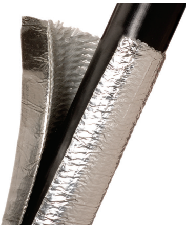
T6® is shipped in pre-cut 4' lengths