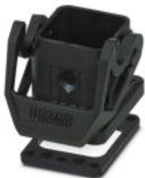
Panel mounting base D7, with single locking latch, material: PA, height: 25.5 mm, cable gland: none, support sleeve: no, Standard

Please be informed that the data shown in this PDF Document is generated from our Online Catalog. Please find the complete data in the user's documentation. Our General Terms of Use for Downloads are valid ( http://phoenixcontact.com/download )