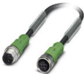
Sensor/actuator cable, 3-position, Variable cable type, Plug straight M12, A-coded, on Socket straight M12, A-coded, cable length: Free input (0.2 ... 40.0 m)

Please be informed that the data shown in this PDF Document is generated from our Online Catalog. Please find the complete data in the user's documentation. Our General Terms of Use for Downloads are valid ( http://phoenixcontact.com/download )