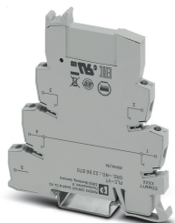
VARIOFACE feed-through terminal block (2-conductor screw connection), for PLC-INTERFACE universal series

Please be informed that the data shown in this PDF Document is generated from our Online Catalog. Please find the complete data in the user's documentation. Our General Terms of Use for Downloads are valid ( http://phoenixcontact.com/download )