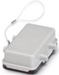
HEAVYCON protective cover, B10 series, for sleeve housing with double locking latch, with retaining cord, IP54, with seal

Please be informed that the data shown in this PDF Document is generated from our Online Catalog. Please find the complete data in the user's documentation. Our General Terms of Use for Downloads are valid ( http://download.phoenixcontact.com )