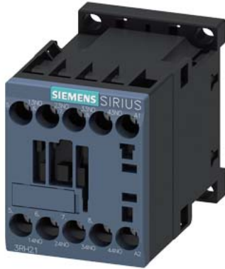
Contactor relay, 4 NO 277 V AC, 60 Hz Size S00, screw terminal