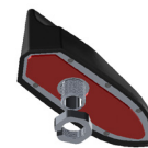
Bolt Mount with Adhesive Pad

The MULTIMAX FV antenna builds on the best in class RF performance, leading design features, and extended operational life of our highly successful Fleet and Public Safety Antenna products. This new product line also offers a rugged low-profile design which gives you greater protection against all the natural hazards a vehicle faces including vibration, hot, cold, ice, salt, dirt, car washes, and tree branch sweeps. Our antennas typically outlast the life of a vehicle.