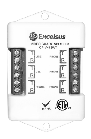
CP-V413WT VDSL2 Video-Grade CPE Splitter

The CP-V413WT Video-Grade CPE Splitter is one of many splitters and filters manufactured by Excelsus, a brand of Pulse, for digital services within homes, offices, and hotels. Excelsus is the number one selling brand of DSL filters and splitters worldwide.