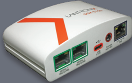
SGX 5150 MD