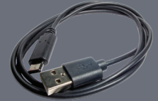
USB Cable Type A to C