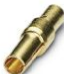
Crimp contact, turned, Single contact, contact diameter: 1 mm, crimp range: 0.08 mm 2 ... 0.22 mm 2