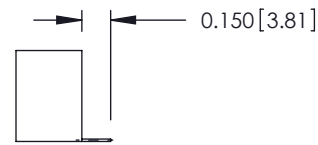
554 Contact Code