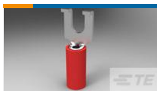
TE Part #32562 PIDG SPDFLG 22-16COMM22-18MIL6