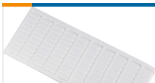
TE Part #1SNK150111R0000 MC612PA 101->110 (x10) Horizontal