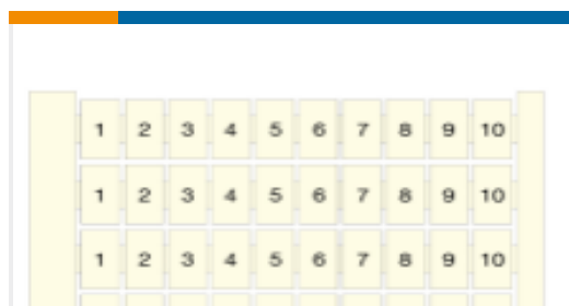
TE Part #1SNA234002R2000 RC810 1->10 (X10) HORIZONTAL