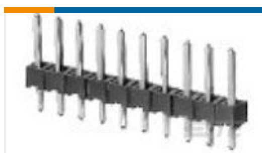
TE Part #9-146276-0 40 MODII HDR SRST B/A .100CL