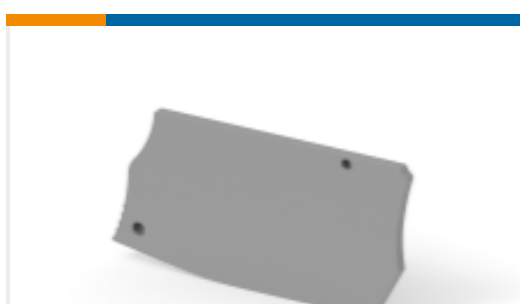
TE Part #1SNK505911R0000 ES6-4S