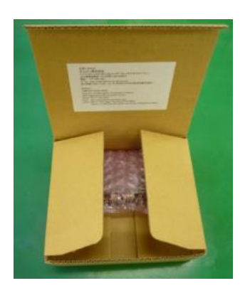
Conversion Board package