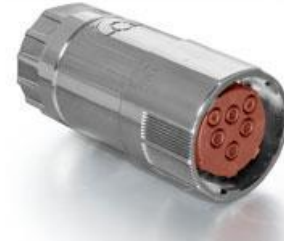
Contact Arrangement mating view

C ST A 263 NN 00 44 0020 000 C S A 263 N 00 44 0020 000