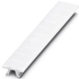
Zack marker strip, 10-section, vertically labeled with the consecutive numbers: 1 ... 10, white, width: 6 mm

Please be informed that the data shown in this PDF Document is generated from our Online Catalog. Please find the complete data in the user's documentation. Our General Terms of Use for Downloads are valid ( http://phoenixcontact.com/download )