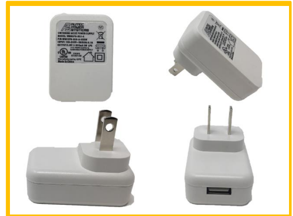
*Product images are for illustrative purposes only and may vary from actual design.