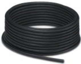
Cable ring, black PE-X, 1-pos., cable length: 500 m

Please be informed that the data shown in this PDF Document is generated from our Online Catalog. Please find the complete data in the user's documentation. Our General Terms of Use for Downloads are valid ( http://phoenixcontact.com/download )