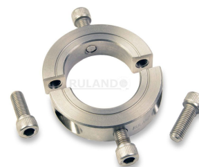
*Additional hardware NOT included